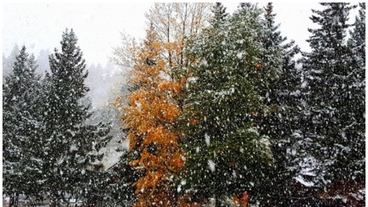
Healing snowfall in October