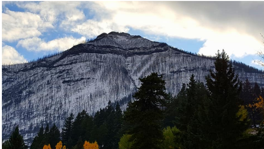
Bertha Mountain, mature forest to matchsticks ....

Countless people across the country were deeply affected, calling for news and reassurance for weeks. It is a miracle that no lives were lost.