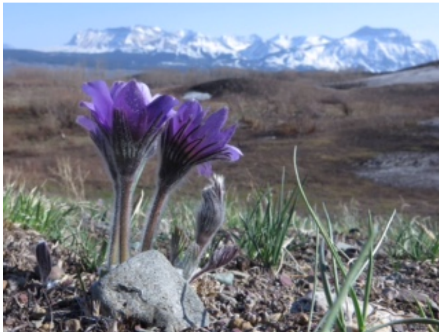
Resilience and resurrection after the fire.

When communities gather like that, the unconditional love of God abounds.