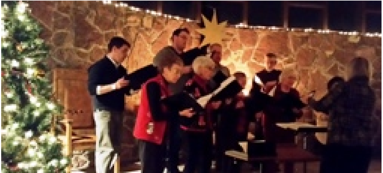
The Southminster U.C. Chancel Choir